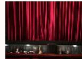
Open the curtains to great shows: opera, concert or plays

Our local museums have a lot to offer, from our seafaring history, to East India Trading and our Design tradition. Combine visits to museums with some of our trendiest boutiques to shop for clothes before everyone else gets them. Enjoy a night at the opera, a modern dance performance or why not listen to our world famous symphonic orchestra?