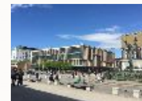
Götaplatsen is just one example of architecture through the ages

With a "recent" history spanning five centuries, there is a lot to see in Gothenburg. Our city is home to Volvo (with an interesting museum), we have a long naval history and loads of interesting buildings all around the city—from the "Lipstick", our old and new Opera Houses, 19th century to 1950s residential buildings, and the building site for the tallest skyscraper in the Nordics?