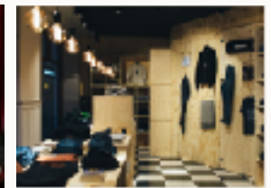
Home to some of the hippest stores you'll find...