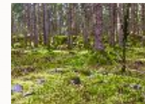
Just minutes from downtown are some amazing forests... Discover their beauty.

How much time do you have? We have more nature than you can possibly imagine. From lush forests to amazing islands, and we can take to you see wildlife where you'll see hundreds of deer and peaceful lakes, or why not visit the archipelago or the city's many parks? Add good food and a bit of history, or why not visit a castle deep in the forest?