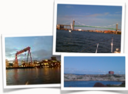
Gothenburg, city by the water: lakes, river & ocean.

Let's be honest: you can't expect to see it all during one visit. Gothenburg, while not a metropolis like Paris, New York or Tokyo, greater Gothenburg is home to over a million people across 3,700 km 2 . We have history to show you dating back to the Bronze and Iron Age. Not to mention countless treasures just a little further away, e.g. Bohuslän.