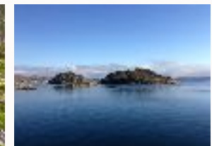
The Gothenburg archipelago is a sight to behold with lots to keep you busy.